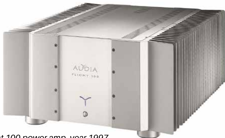
Flight 100 power amp, year 1997