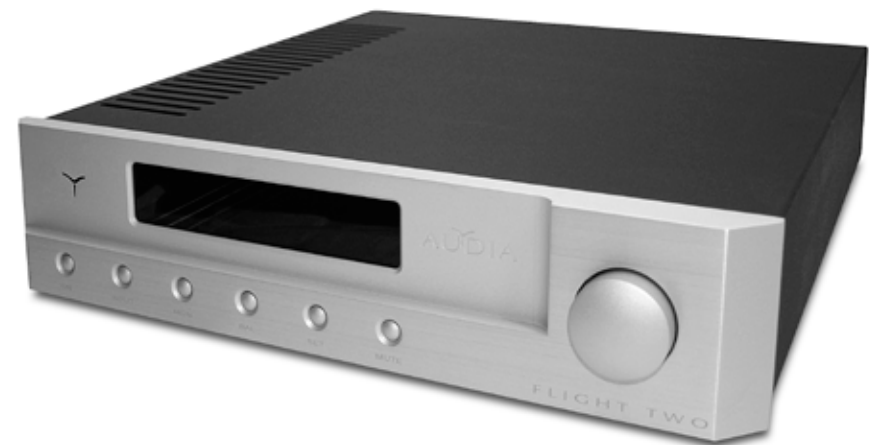
FL Two integrated amp, year 2005