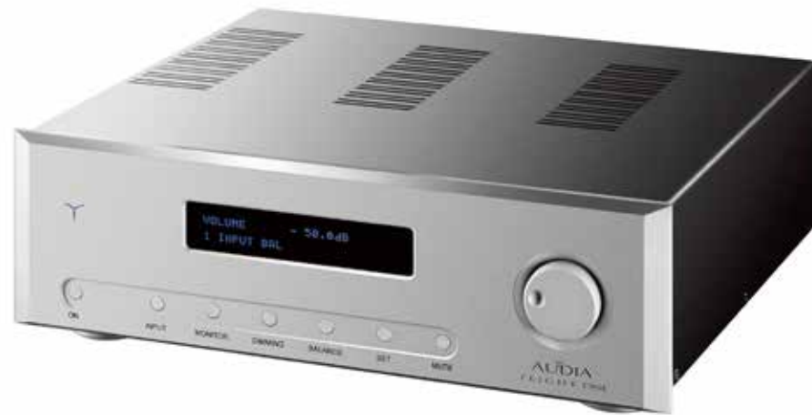
Flight One integrated amp, year 2001