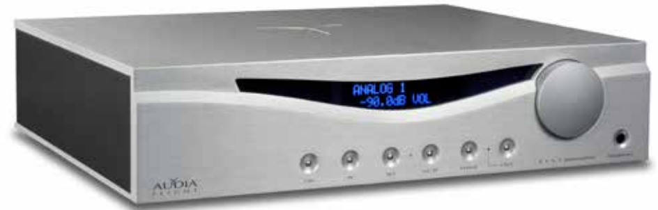
FLS 1 preamp, in production