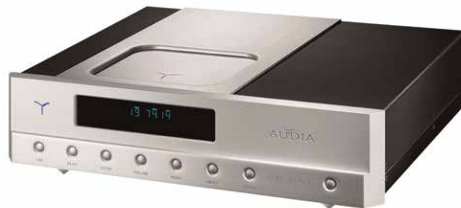
Flight CD1 CD player, year 2003