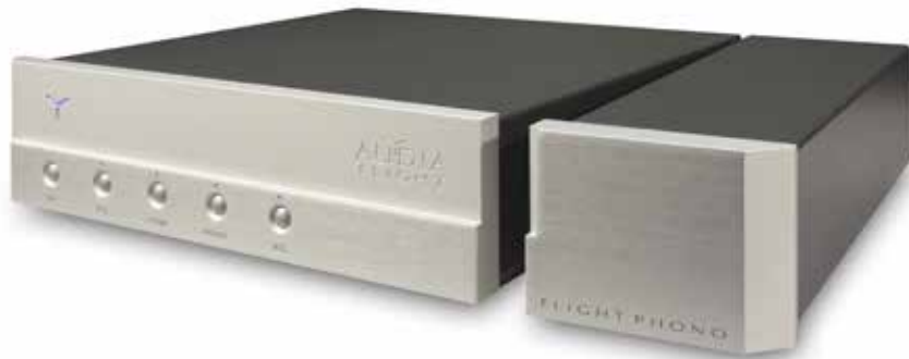
Flight Phono Pre phono, in production