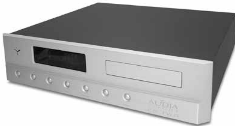
FL CD Two CD player, year 2005