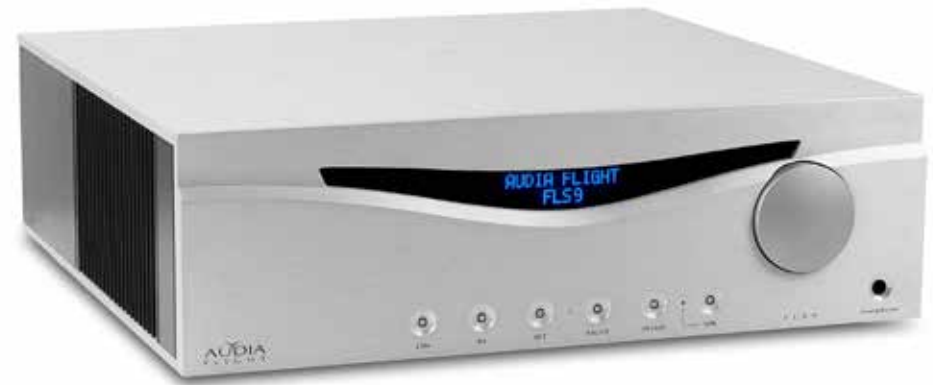
FLS 9 integrated amp, in production