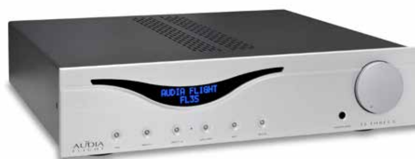
FL Three S integrated amp, in production