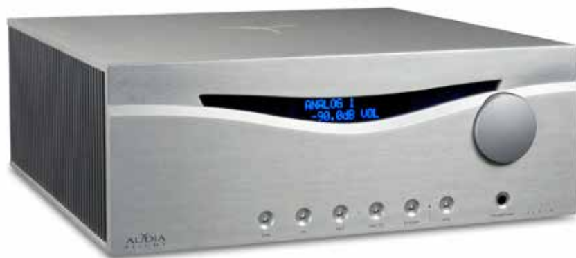
FLS 10 integrated amp, in production