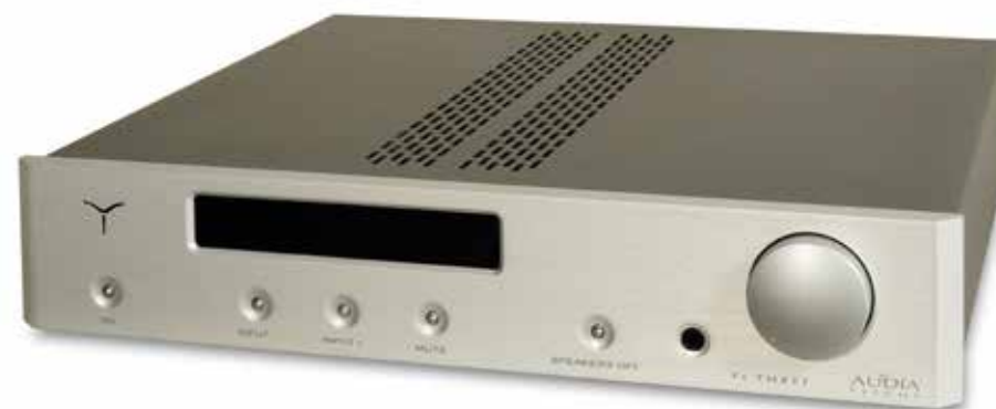
FL Three integrated amp, year 2008