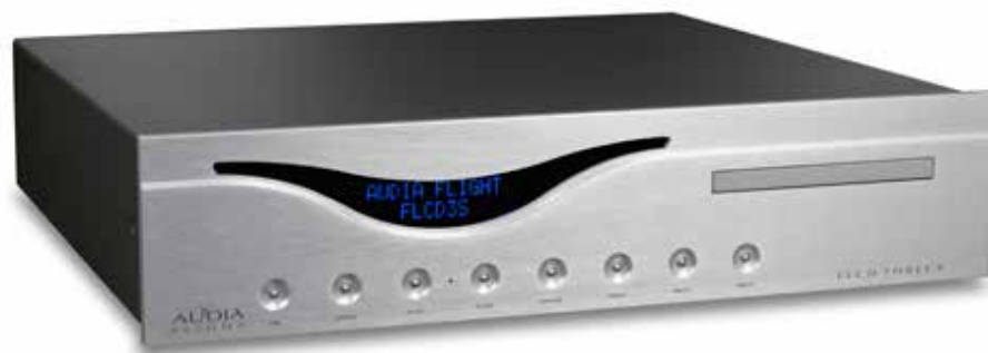
FL CD Three S CD player, in production