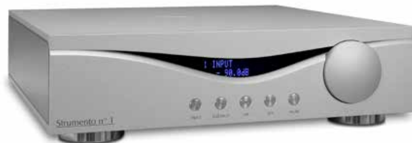
Strumento 1 MkII preamp, in production