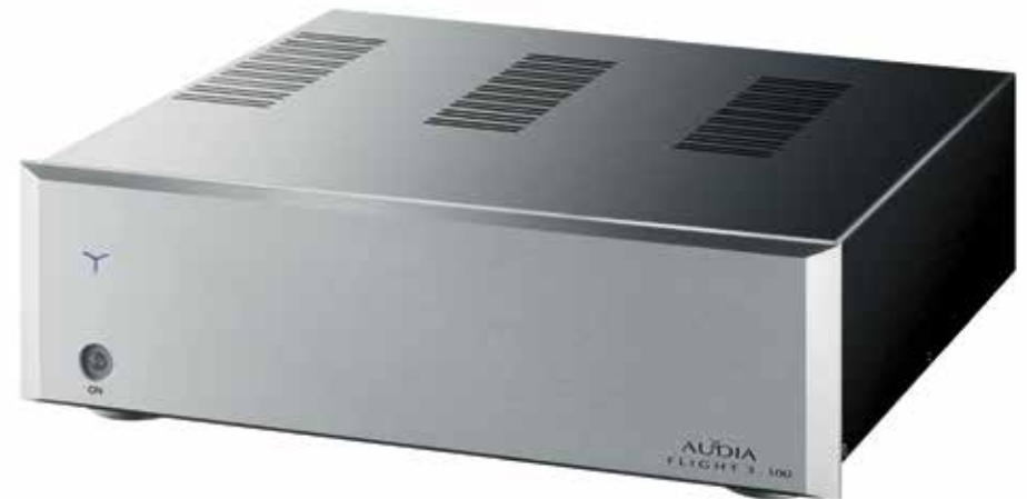
Flight 3.100 3channel amp, year 2002