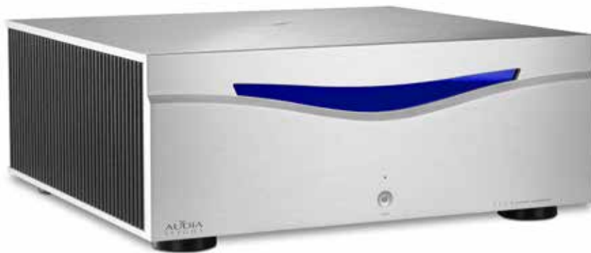
FLS 4 power amp, in production