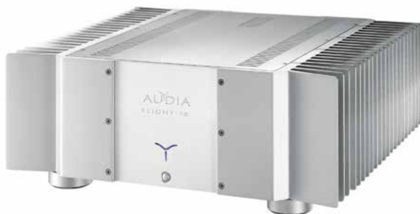
The power amp Flight 50, year 1998