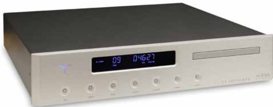
FL CD Three CD player, year 2010