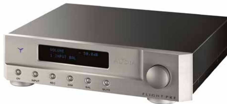
Flight Pre preamp, year 1998