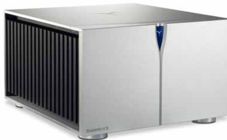
Strumento 8 mono power, in production